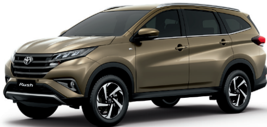
BRONZE MICA METALLIC