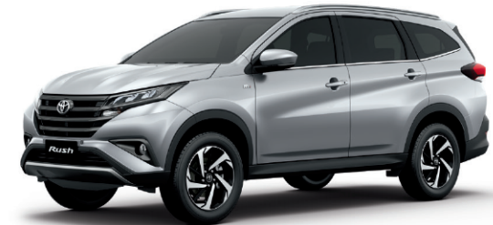
SILVER MICA METALLIC