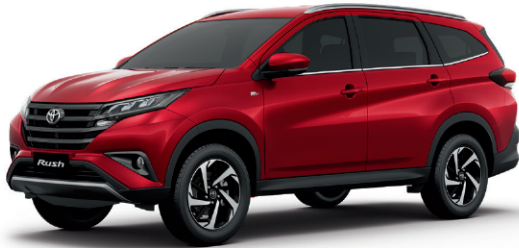
DARK RED MICA METALLIC