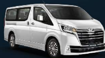
White Pearl Crystal Shine