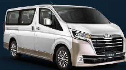
Luxury Pearl Toning